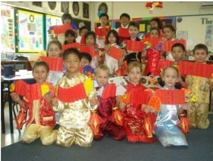
Showing off their Chinese dragon & lantern designs