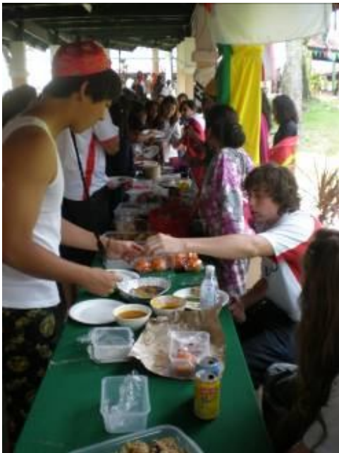
Trying out the spread of delicious food