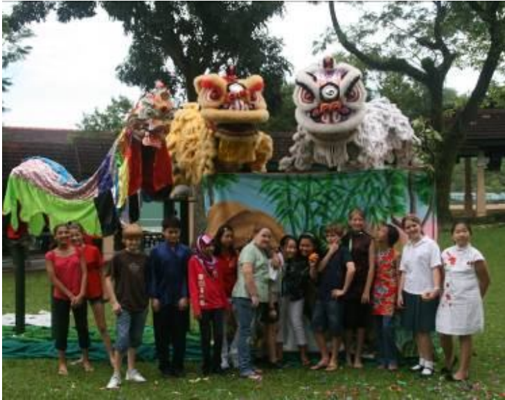
Dressed in colourful Chinese costumes